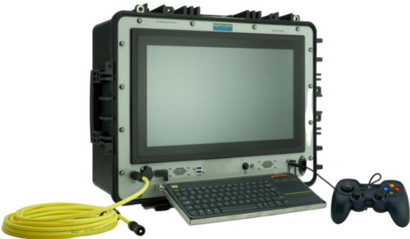
BlueROV2 Control case With waterproof daylight Monitor