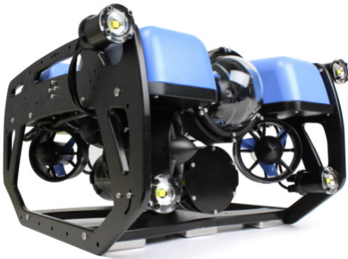
Affordable multipurpose ROV BlueRobotics